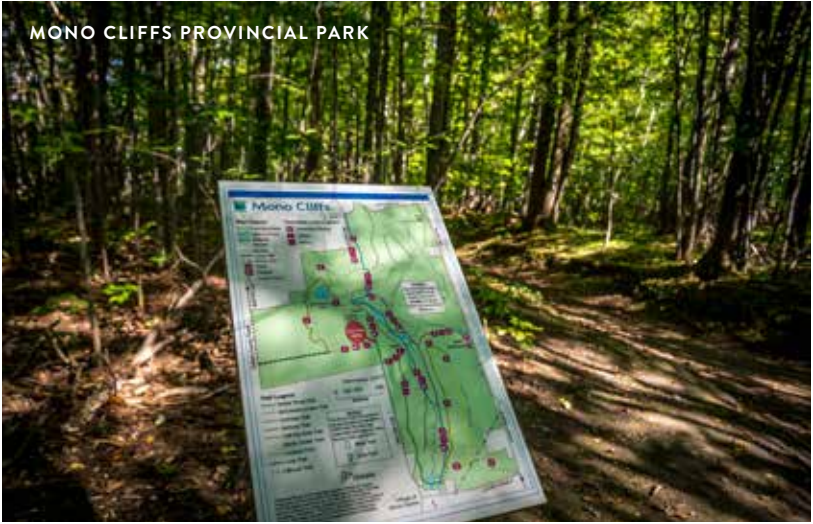
MONO CLIFFS PROVINCIAL PARK

Hundreds of kilometres of trails and greenspace to explore.