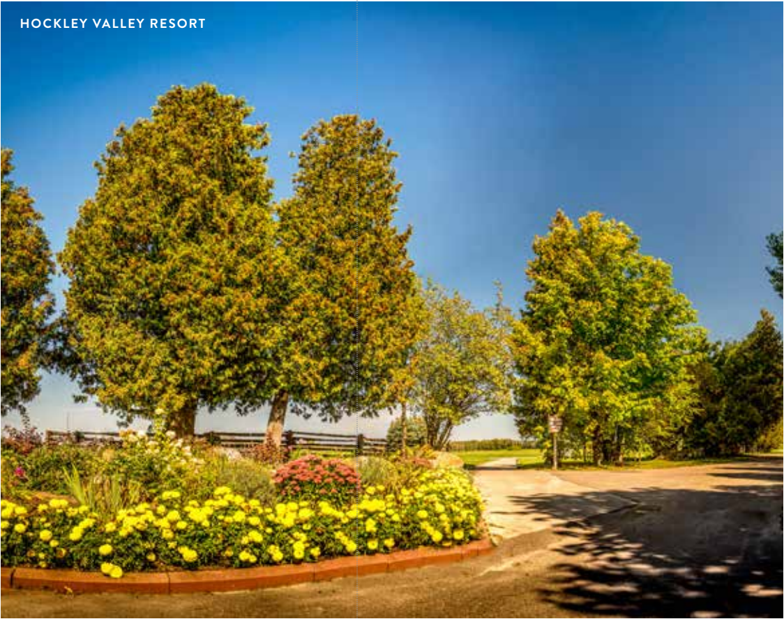
HOCKLEY VALLEY RESORT

Emerald Crossing and the surrounding area boast some of Dufferin County’s most extensive and untouched greenspace. Here, countless kilometres of trails meander and snake through virtually untouched foliage, along the world-renowned Bruce Trail, to Murphy’s Pinnacle Lookout and beyond. In Shelburne, true four-season enjoyment can be had regardless of the temperature. From nearby ski hills and rinks, to untold cross country and snowmobiling trails in winter, to the Bruce Trail, Split Rock Narrows, and Mono Cliffs Provincial Park year round, Shelburne has no shortage of ways to get out and enjoy nature in its purest form.