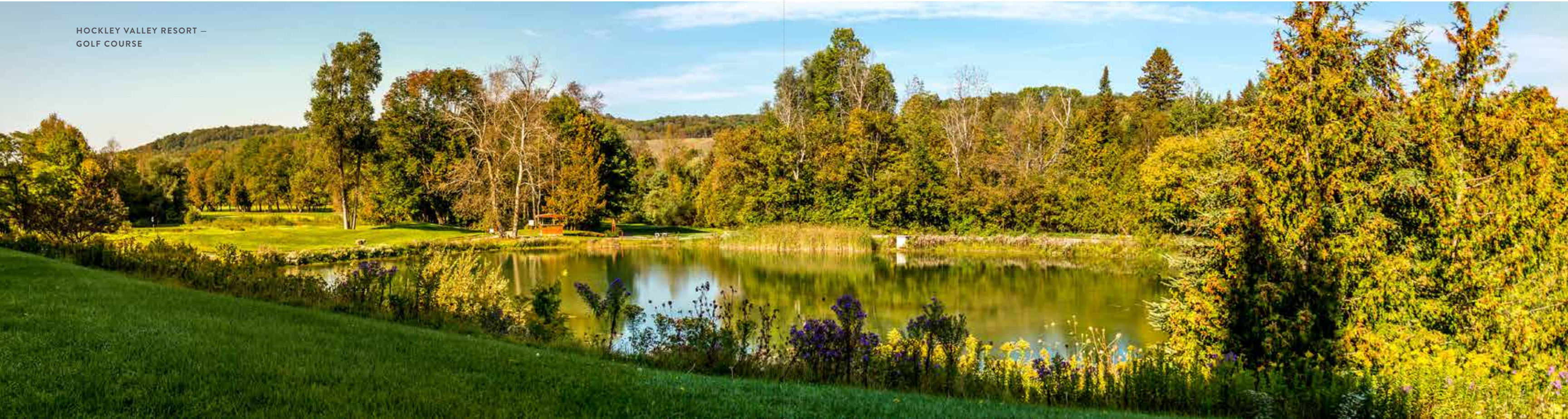
HOCKLEY VALLEY RESORT — GOLF COURSE

Hundreds of kilometres of trails and greenspace to explore.